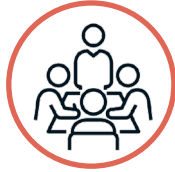
Panels of Senior Leaders