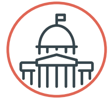
Views from Capitol Hill